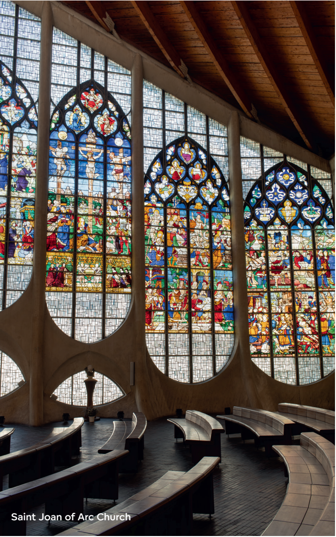
Saint Joan of Arc Church