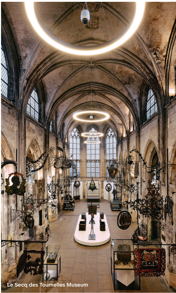
Le Secq des Tournelles Museum