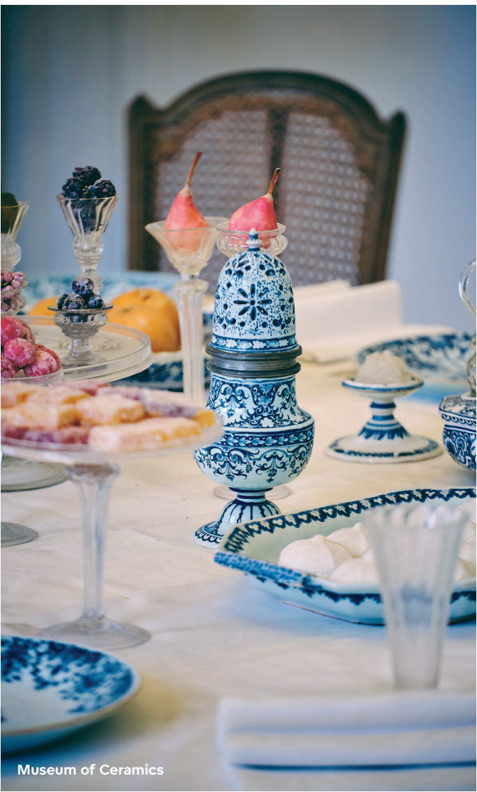
Museum of Ceramics